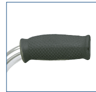
Contoured vinyl hand grip